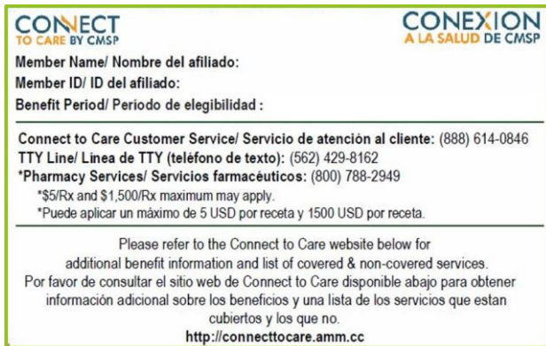
Sample ID Card Front

Connect to Care members receive an ID card (example below) and a Member Guide in the mail. All member information is provided in English and Spanish. The ID card provides the unique member identification number, the benefit period, important phone numbers and required copay for prescriptions. Please note, Connect to Care members will NOT be issued a Beneficiary Identification Card (BIC) and will NOT be assigned a Client Index Number (CIN).